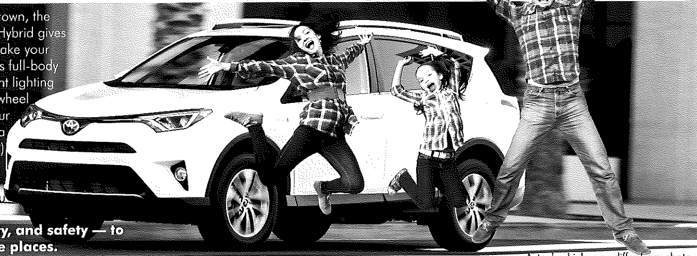
Actual vehicle may differ from photo

Around town or out of town, the 2017 Toyota RAV4 SE Hybrid gives you the opportunity to take your journeys even further. Its full-body color treatment, ambient lighting and a heated steering wheel are there to cater to your needs. And since Toyota Safety Sense™ P (TSS-P) 24 comes standard on every RAV4, you have everything you need — style, SUV capability, and safety — to venture out to more places.